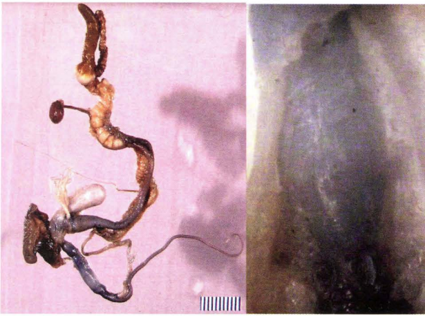
Fig. 4 Helix goderdziana sp. nov. genitalia (paratype n0009): left - full view, right - penial papilla.

H. buchi . Penial papilla larger than in H. buchi , spindle-shaped (for reproductive organs of H. buchi and other Helix species see Schileyko 1978).