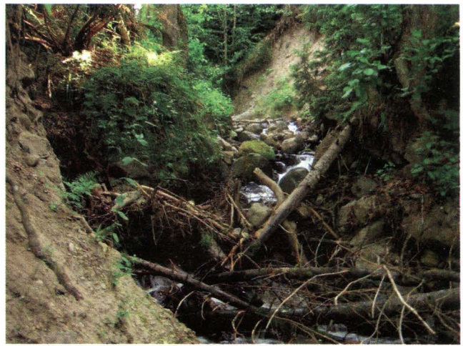
Fig. 5 Type locality of Helix goderdziana sp. nov. habitat

Ecology The macrohabitat is a montane spruce forest (dominant tree Picea orientalis ), on the southern slopes of the Meskheti Mountain Range and the north-eastern slopes of the Shavsheti Mountain Range. It is a humid area, with the annual precipitation of ca 1200-1400 mm (Vladimirov et al. , 1991). The microhabitat is a very damp vicinity of small montane brooks, mostly surrounded by alder trees ( Alnus barbata ), with logs and liverworts on the margins of the brooks (Fig.5). The snail is found in habitats different from those of Helix buchi : the latter species is found exclusively in broadleaf, mostly beach forests, away from streams or brooks (Skarlato & Starobogatov, 1984).