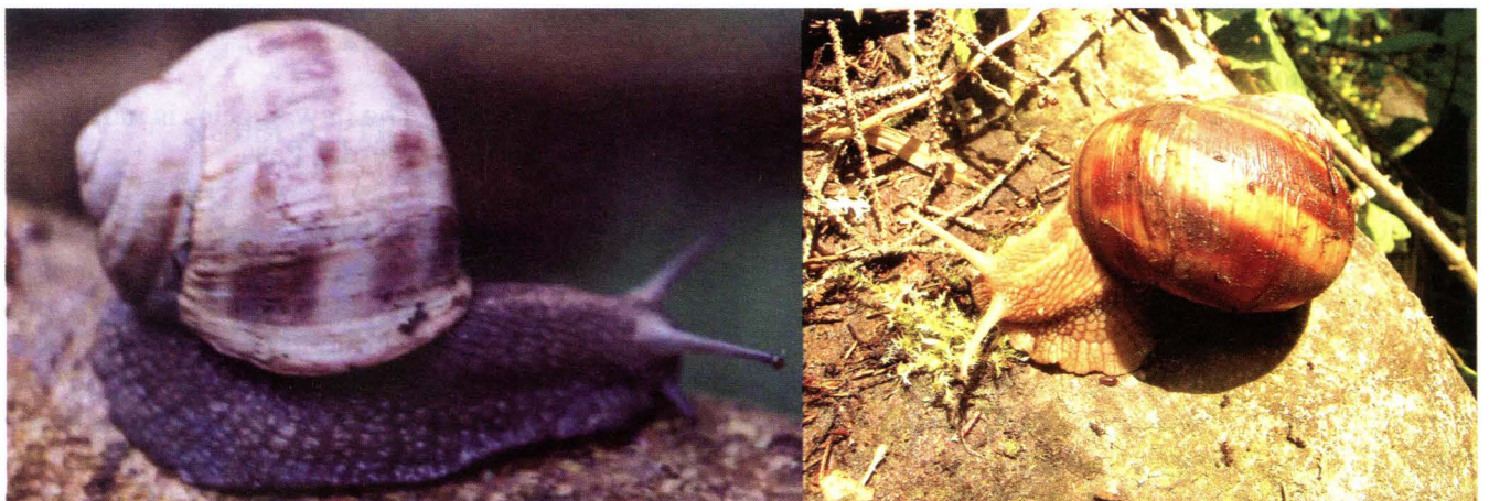
Fig. 3 Left – live Helix buchi , right – live Helix goderdziana sp. nov. (paratype n0009)